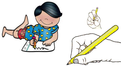
(the three finger grip)